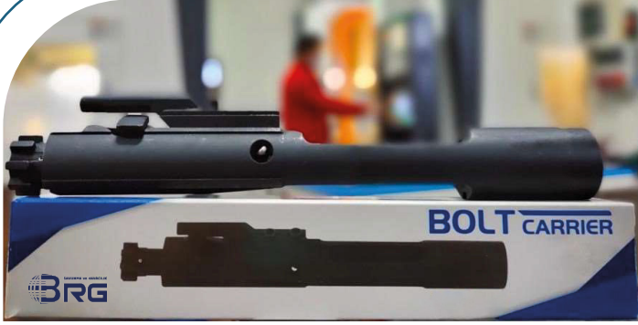
223 / 5.56 Bolt Carrier Group, Nitride QPQ MPI